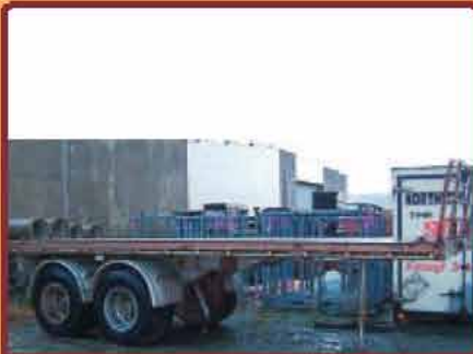
1974 Domett 6.3m rear deck B-Train, 6m twist locks. As is.