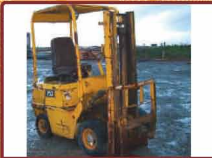
1974 Lees Forklift 1.2 tonne lift. As is.