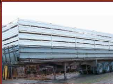
1974 Domett 40ft, flat deck semi with 3 deck crate, current C.O.F.