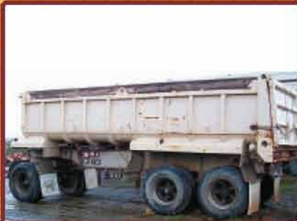
1977 Domett Bath Tub Tipper, current C.O.F.