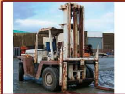
Clark 10 tonne Forklift with container width forks.