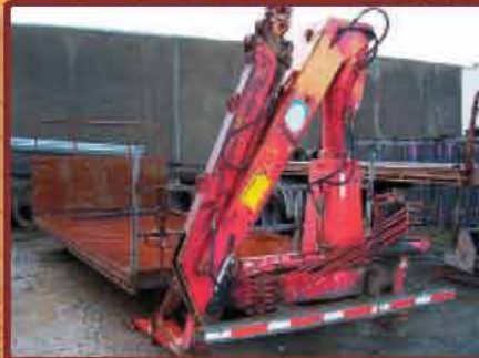
HMF 5 tonne Crane fitted to twist lock 5.550m steel deck.