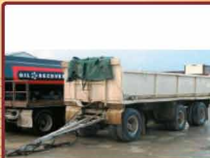
1978 TMC Bulk Body Tip Trailer