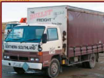
1991 Isuzu NPR, 4 tonne LH curtainsider.