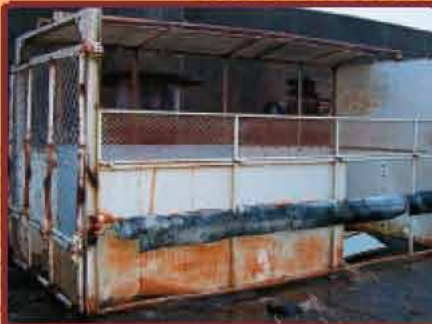
3 Lift Out Silage Bins, 4.7m.