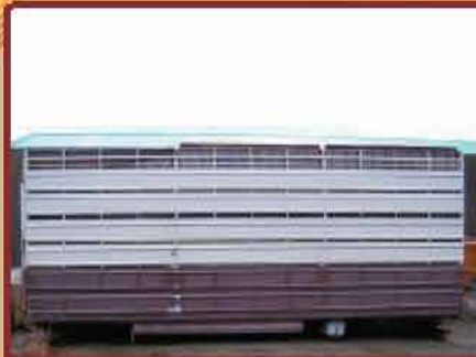
Sutton Stock Crate, 6.7m, 3 deck.